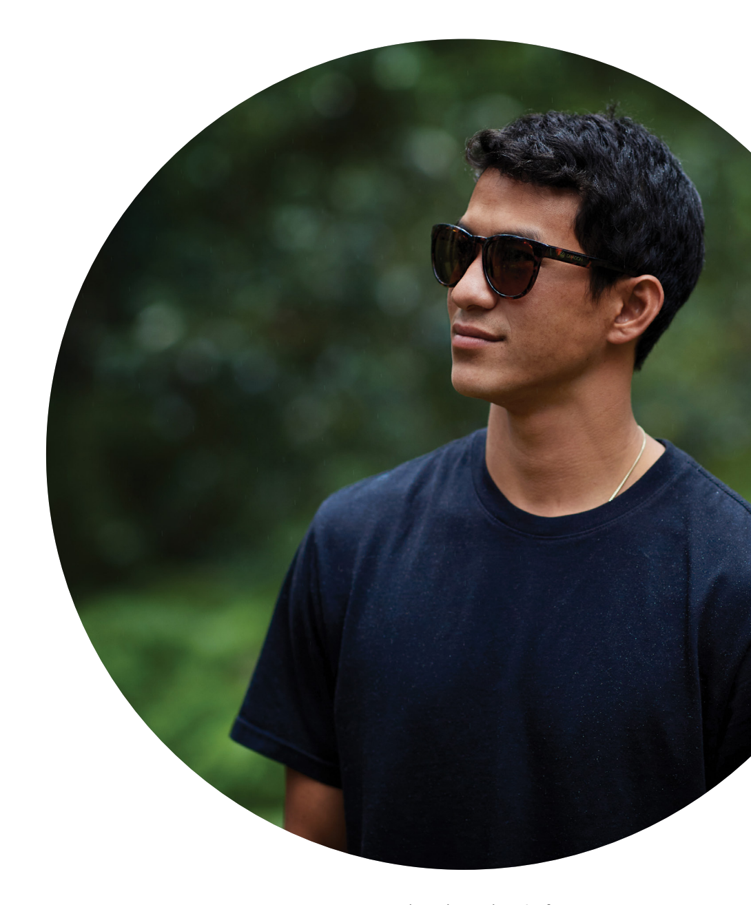
Dragon® plant-based resin frames

VSP has also embraced a distributed workforce, profoundly impacting our carbon footprint. With about 35 percent of our U.S. workforce working remotely, we greatly reduced the need for daily commuting to a centralized office, resulting in significant reductions in carbon emissions* compared to traditional office-based operations. This shift aligns with our corporate values of supporting the physical and mental health of our workforce and reflects our dedication to minimizing our ecological footprint. Beyond the immediate environmental benefits, our distributed workforce model fosters a culture of flexibility and work-life balance, enhancing employee satisfaction and productivity.